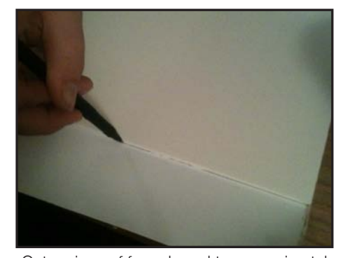
Cut a piece of foam board to approximately 8"x 10"