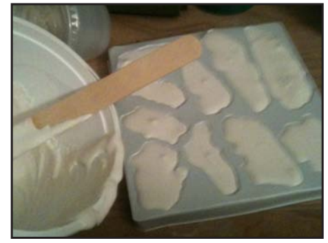
Make and color rocks. Glue in place for path and campfire ring, making sure to leave enough room for the tea light. Fill in the path with Talus.