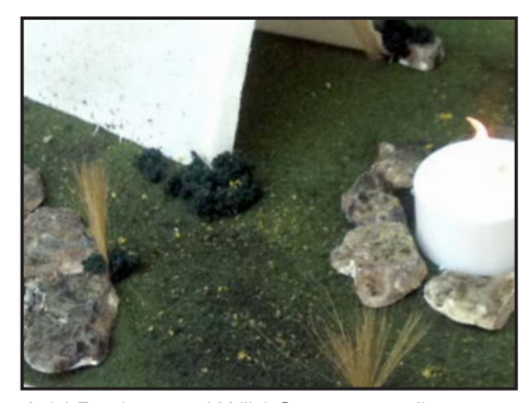
Add Bushes and Wild Grass as well as any additional details. Sprinkle other Turf colors around the tent and campfire and spray with Project Glue. Place tea light in campfire ring.