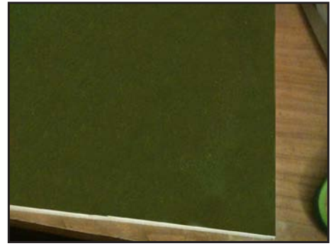
Spray with Project Glue and cover generously with Turf. Spray Turf again with Project Glue.