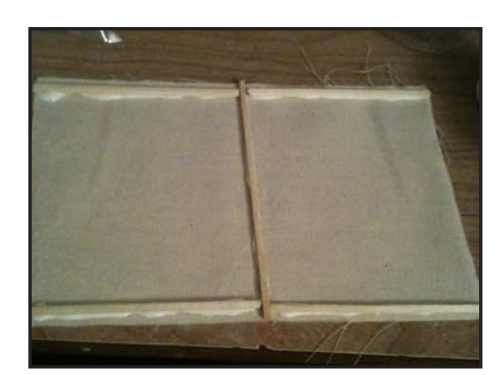
Cut a piece of cloth or construction paper, approximately 8" x 5". Cut 4 sticks approximately 4" long for ends of tent. Cut 1 stick approximately 5" long for the middle of the tent.